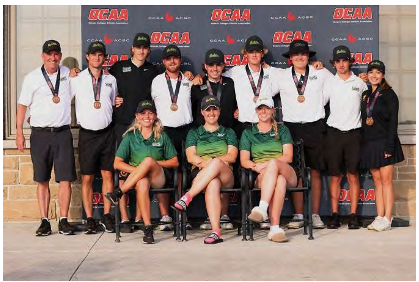
St. Clair College women's and men's golf teams take part in CCAA Golf National Championships. October 16, 2023

St. Clair College's golf teams are heading to the 2023 CCAA Golf National Championships.