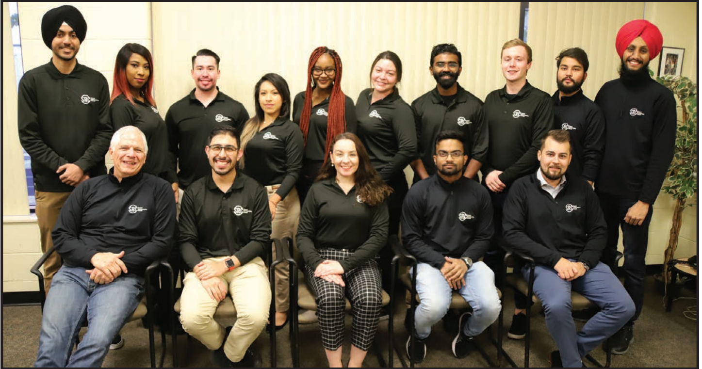
The 2019-20 Student Representative Council Board of Directors, left to right: