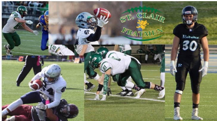
St Clair Fratmen

The St. Clair Fratmen Football team picked up five new 2020 roster additions including a pair from New Brunswick and Niagara Falls as well as another local all-star.