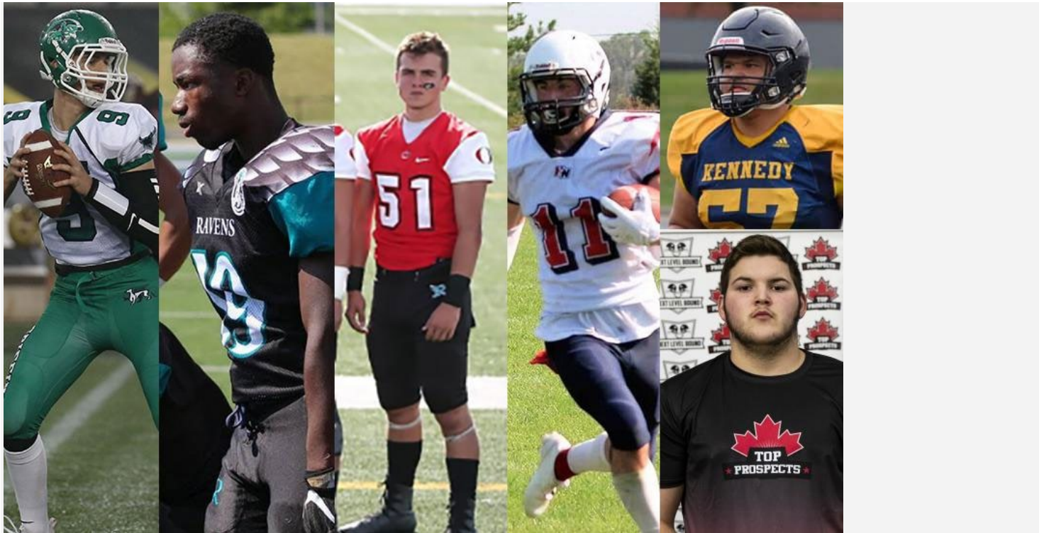
St Clair Fratmen - (photo courtesy of St Clair Athletics)

In local football news, the St Clair Fratmen have added some outstanding local players for the upcoming season.