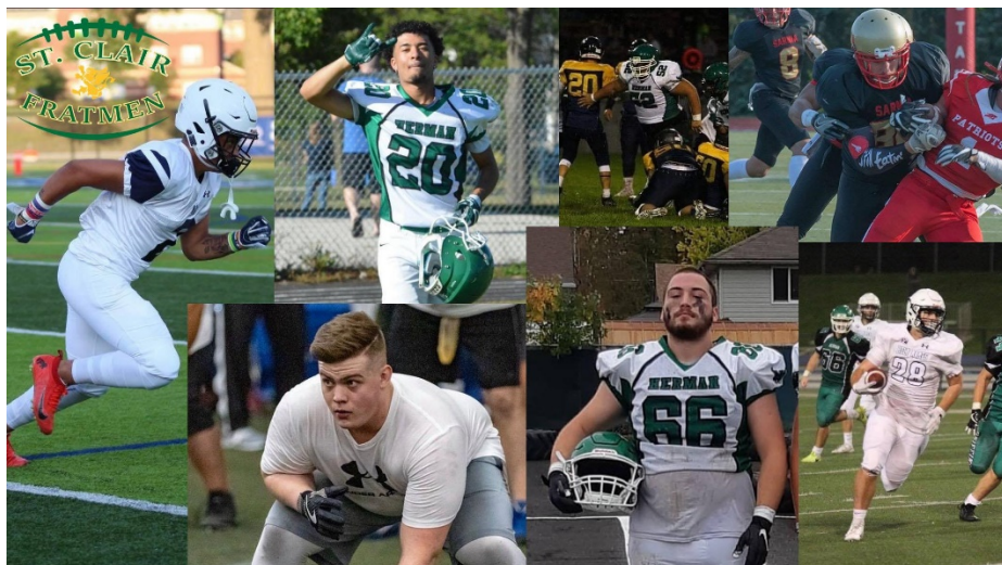
Sr Clair Fratmen- recruits- May 2020

The St. Clair Fratmen Football team welcomes to their 2020 incoming roster a pair of top out of town recruits as well as five local standouts