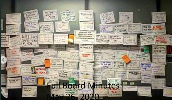
Full Board Minutes: May 26, 2020