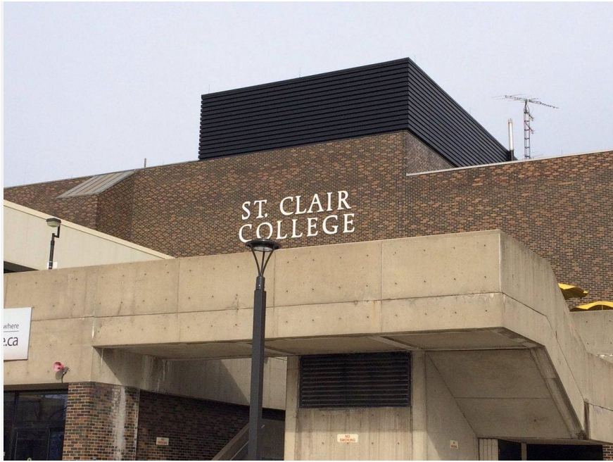
St. Clair College Main Campus