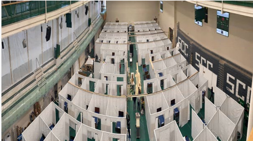
The Windsor Regional Hospital field hospital inside of the St. Clair College SportsPlex. April 2020

Several groups have come together to make sure patients at the field hospital for Windsor Regional Hospital are still connected with loved ones.