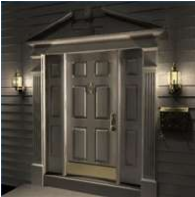
Doorknob and Kickplate

Updating the look of the exterior of your home can be as simple as changing the hardware to your front door.