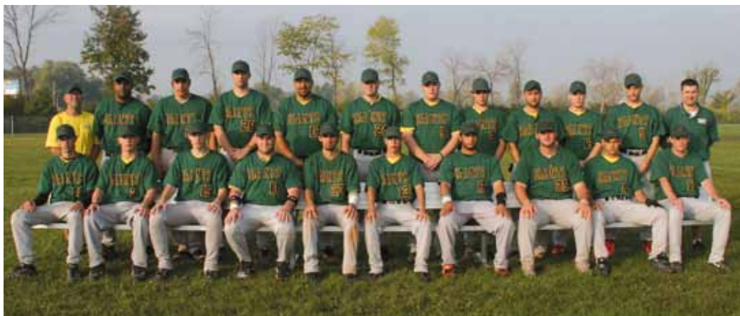
The new Saints Men's Varsity Baseball Team.