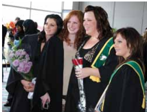
Our newest alumni!

If you are interested in being part of the 2008 Alumni Speakers Series Tour call the alumni office at 519-972-2727 ext 4567 or e-mail us at alumni@stclaircollege.ca .