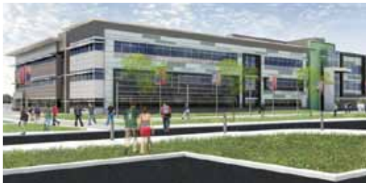
Architectural rendering of new Health Sciences Building.

Windsor West MPP and Cabinet Minister Sandra Pupatello said "the timing is perfect, the government is guaranteeing Ontario jobs for every nursing graduate and plans are underway for the first "nurse-led clinics which are unheard of elsewhere".