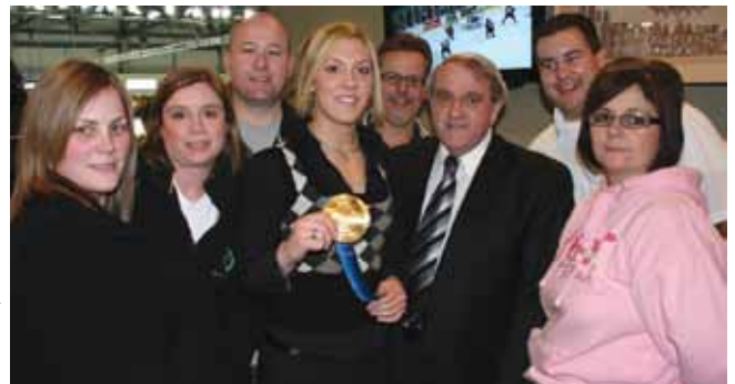
Winter Olympian Women's hockey player Meghan Agosta stopped by the Alumni suite to show off her gold medal to the group.