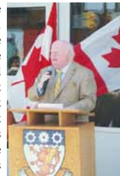
Senator Mike Duffy addresses the attendees.

The building has two computer labs each having a capacity for 50 students. There are four classrooms with a capacity of 50 each with portable walls to accommodate two rooms of 50 or one room of 100. The NewsPlex area includes a nexus, four television edit bays, radio control room, radio studio, television studio, television control room and computer lab.