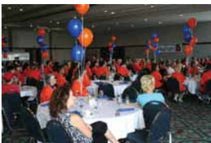
Raise-A-Reader breakfast at SCCA.

Raise-A-Reader is a nationally recognized CanWest fundraising event that creates awareness of children's literacy in our city, province and country. In just five years, this national campaign has raised more than $7.45 million