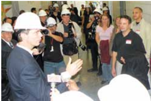
Premier Dalton McGuinty speaking to students.

College a place where students can receive the best of state-of-the-art training and facilities to prepare for our changing economy. We appreciated the visit of Premier Dalton McGuinty to see the provincial investment at work. This is a great place to move people who have lost their jobs due to the global recession, into new careers with the skills and confidence they will need to succeed.