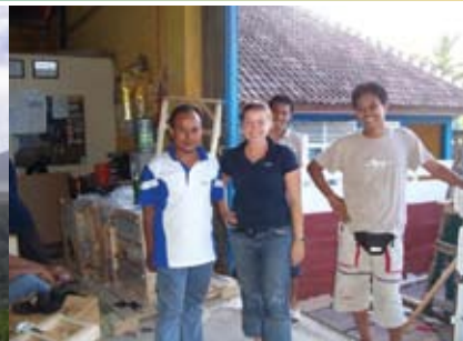
At work packaging materials.

and hand-crafted by artists from all over the world, and will enhance any room of your home, office or business.